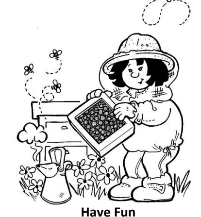
Take Care of Environment